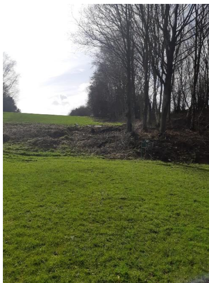
Back of 13 th 18 th