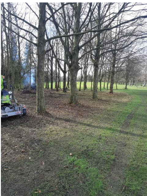
Back of 5 th