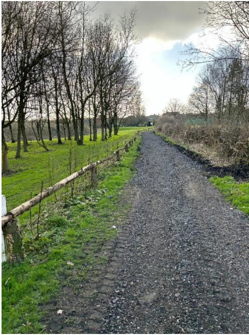
Path public pathway along 1 st hole