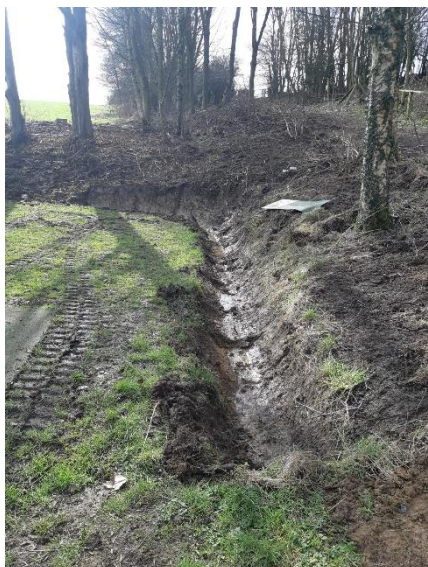
Work on back of 13 th